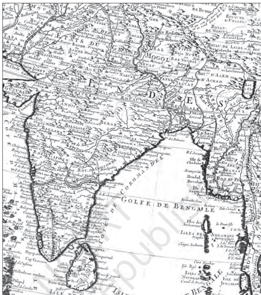
Map 2 The subcontinent, from the early-eighteenth-century Atlas Nouveau of Guillaume de l'Isle.

and there are some well-known names like Kanauj in Uttar Pradesh (spelt in the map as Qanauj). Map 2 was made nearly 600 years after Map 1, during which time information about the subcontinent had changed considerably. This map seems more familiar to us and the coastal areas in particular are surprisingly detailed. This map was used by European sailors and merchants on their voyages (see Chapter 6).