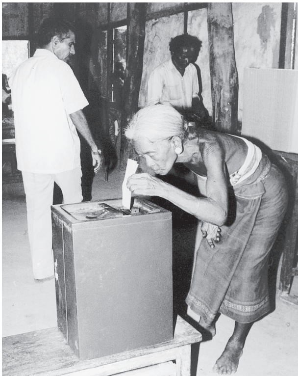
An old lady voting in election

Modern society, with its size and complexity, offers few opportunities for direct democracy. Today, the most common form of democracy, whether for a town of 50,000 or nations of 1 billion, is representative democracy, in which citizens elect officials to make political decisions, formulate laws, and administer programmes for the public good. Ours is a representative democracy. Every citizen has the important right to vote her/his representative. People elect their representatives to all levels from Panchayats, Municipal Boards, State Assemblies