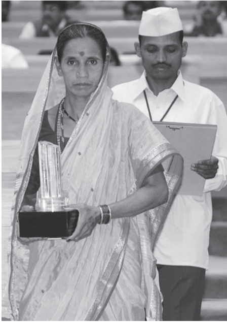
A woman Panch with her reward

importantly, control of local resources is given to the elected local bodies.