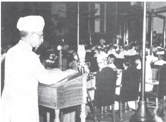
Sarvepalli Radhakrishnan addressing the Constituent Assembly

Read both the Karachi Resolution and the Preamble carefully. Identify the key ideas that exist in it.