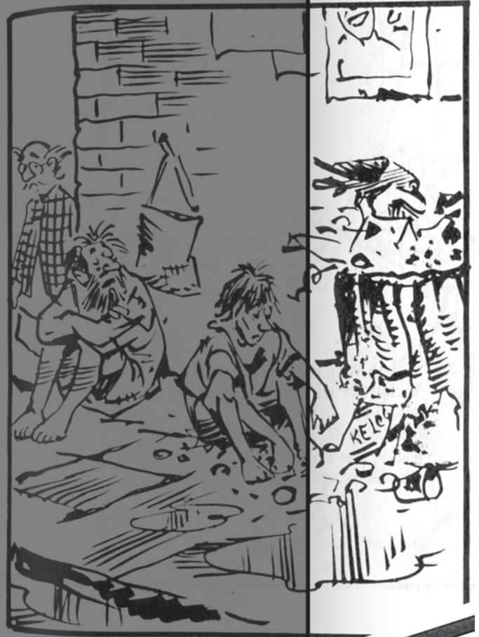
Be careful about what you eat of poisoning around

s tion was a major media affair. And their elegant paintings and curtains