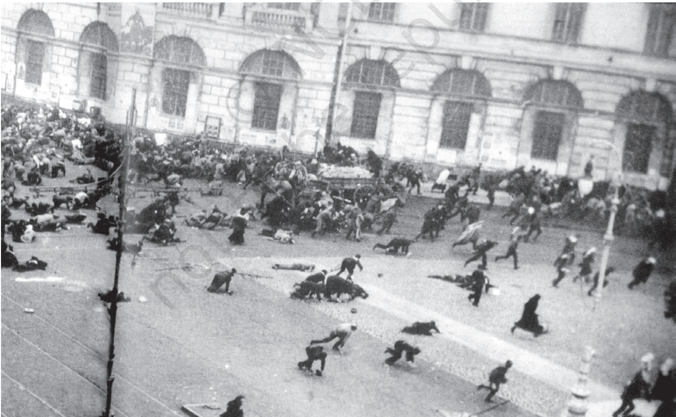
Fig.10 – The July Days. A pro-Bolshevik demonstration on 17 July 1917 being fired upon by the army.