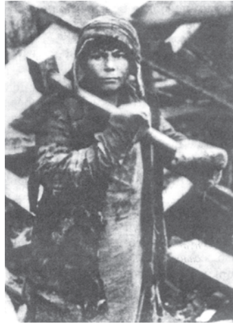
Fig. 16 – A child in Magnitogorsk during the First Five Year Plan. He is working for Soviet Russia.