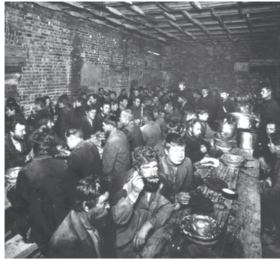
Fig.5 – Unemployed peasants in pre-war St Petersburg.

In the countryside, peasants cultivated most of the land. But the nobility, the crown and the Orthodox Church owned large properties. Like workers, peasants too were divided. They were also