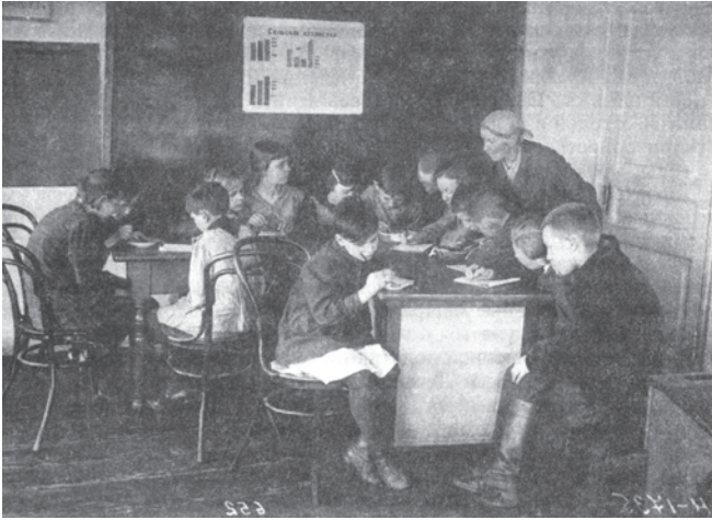
Fig. 15 – Children at school in Soviet Russia in the 1930s. They are studying the Soviet economy.