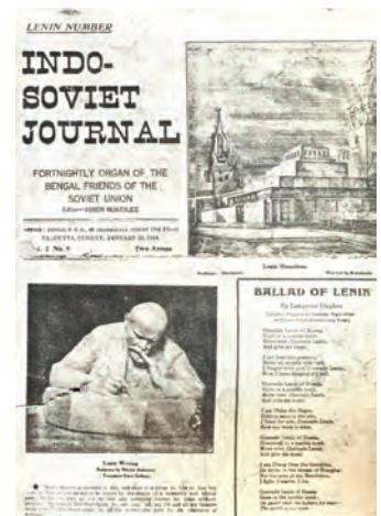
Fig. 20 – Special Issue on Lenin of the Indo-Soviet Journal. Indian communists mobilised support for the USSR during the Second World War.