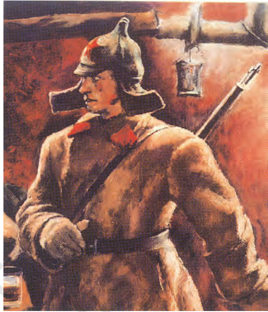
Fig. 12 – A soldier wearing the Soviet hat (budeonovka).

The Bolshevik Party was renamed the Russian Communist Party (Bolshevik). In November 1917, the Bolsheviks conducted the elections to the Constituent Assembly, but they failed to gain majority support. In January 1918, the Assembly rejected Bolshevik measures and Lenin dismissed the Assembly. He thought the All Russian Congress of Soviets was more democratic than an assembly elected in uncertain conditions. In March 1918, despite opposition by their political allies, the Bolsheviks made peace with Germany at Brest Litovsk. In the years that followed, the Bolsheviks became the only party to participate in the elections to the All Russian Congress of Soviets, which became the Parliament of the country. Russia became a one-party state. Trade unions were kept under party control. The secret police (called the Cheka first, and later OGPU and NKVD) punished those who criticised the Bolsheviks. Many young writers and artists rallied to the Party because it stood for socialism and for change. After October 1917, this led to experiments in the arts and architecture. But many became disillusioned because of the censorship the Party encouraged.