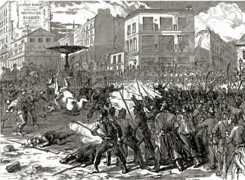
Fig.2 – This is a painting of the Paris Commune of 1871. It portrays a scene from the popular uprising in Paris between March and May 1871. This was a period when the town council (commune) of Paris was taken over by a ‘peoples’ government’ consisting of workers, ordinary people, professionals, political activists and others. The uprising emerged against a background of growing discontent against the policies of the French state. The ‘Paris Commune’ was ultimately crushed by government troops but it was celebrated by Socialists the world over as a prelude to a socialist revolution. The Paris Commune is also popularly remembered for two important legacies: one, for its association with the workers’ red flag – that was the flag adopted by the communards ( revolutionaries) in Paris; two, for the ‘Marseillaise’, originally written as a war song in 1792, it became a symbol of the Commune and of the struggle for liberty.