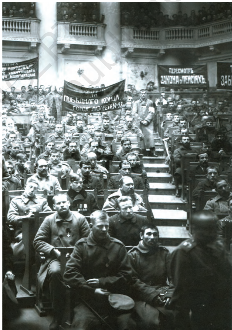
Fig.8 – The Petrograd Soviet meeting in the Duma, February 1917.

On Sunday, 25 February, the government suspended the Duma. Politicians spoke out against the measure. Demonstrators returned in force to the streets of the left bank on the 26th. On the 27th, the Police Headquarters were ransacked. The streets thronged with people raising slogans about bread, wages, better hours and democracy. The government tried to control the situation and called out the cavalry once again. However, the cavalry refused to fire on the demonstrators. An officer was shot at the barracks of a regiment and three other regiments mutinied, voting to join the striking workers. By that evening, soldiers and