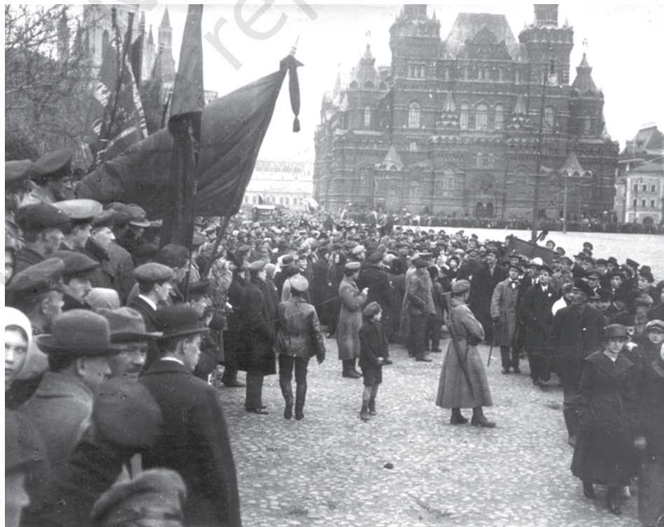
Fig. 13 – May Day demonstration in Moscow in 1918.