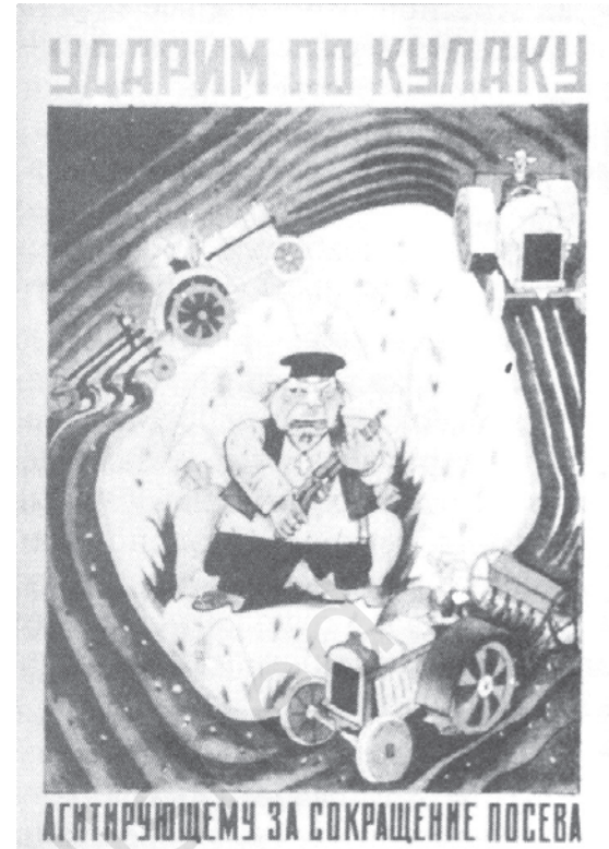
Fig. 18 – A poster during collectivisation. It states: 'We shall strike at the kulak working for the decrease in cultivation.'

Exiled – Forced to live away from one's own country.