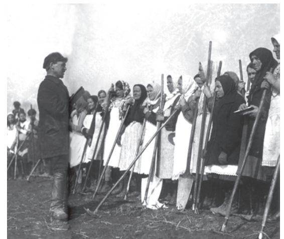
Fig. 19 – Peasant women being gathered to work in the large collective farms.