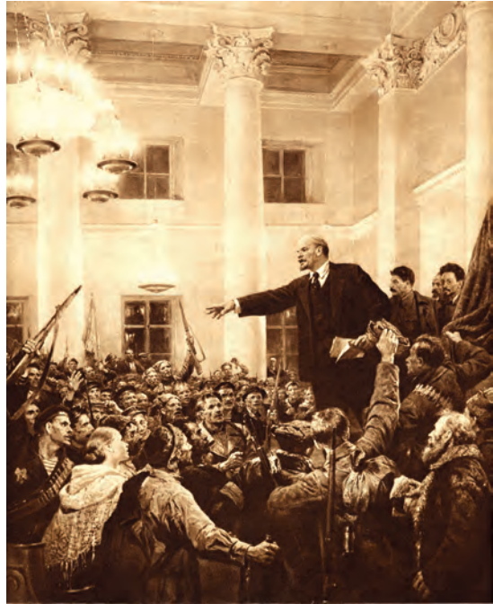
Fig.9 – A Bolshevik image of Lenin addressing workers in April 1917.

Meanwhile in the countryside, peasants and their Socialist Revolutionary leaders pressed for a redistribution of land. Land committees were formed to handle this. Encouraged by the Socialist Revolutionaries, peasants seized land between July and September 1917.