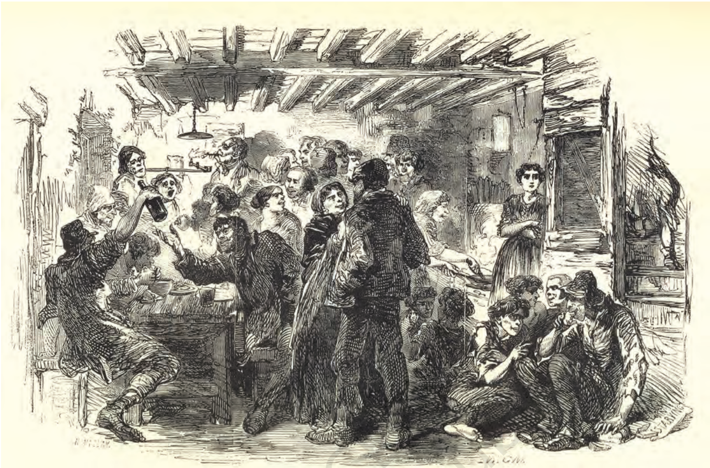
Fig. 1 – The London poor in the mid-nineteenth century as seen by a contemporary. From: Henry Mayhew, London Labour and the London Poor , 1861.

Almost all industries were the property of individuals. Liberals and radicals themselves were often property owners and employers. Having made their wealth through trade or industrial ventures, they felt that such effort should be encouraged – that its benefits would be achieved if the workforce in the economy was healthy and citizens were educated. Opposed to the privileges the old aristocracy had by birth, they firmly believed in the value of individual effort, labour and enterprise. If freedom of individuals was ensured, if the poor could labour, and those with capital could operate without restraint, they believed that societies would develop. Many working men and women who wanted changes in the world rallied around liberal and radical groups and parties in the early nineteenth century.