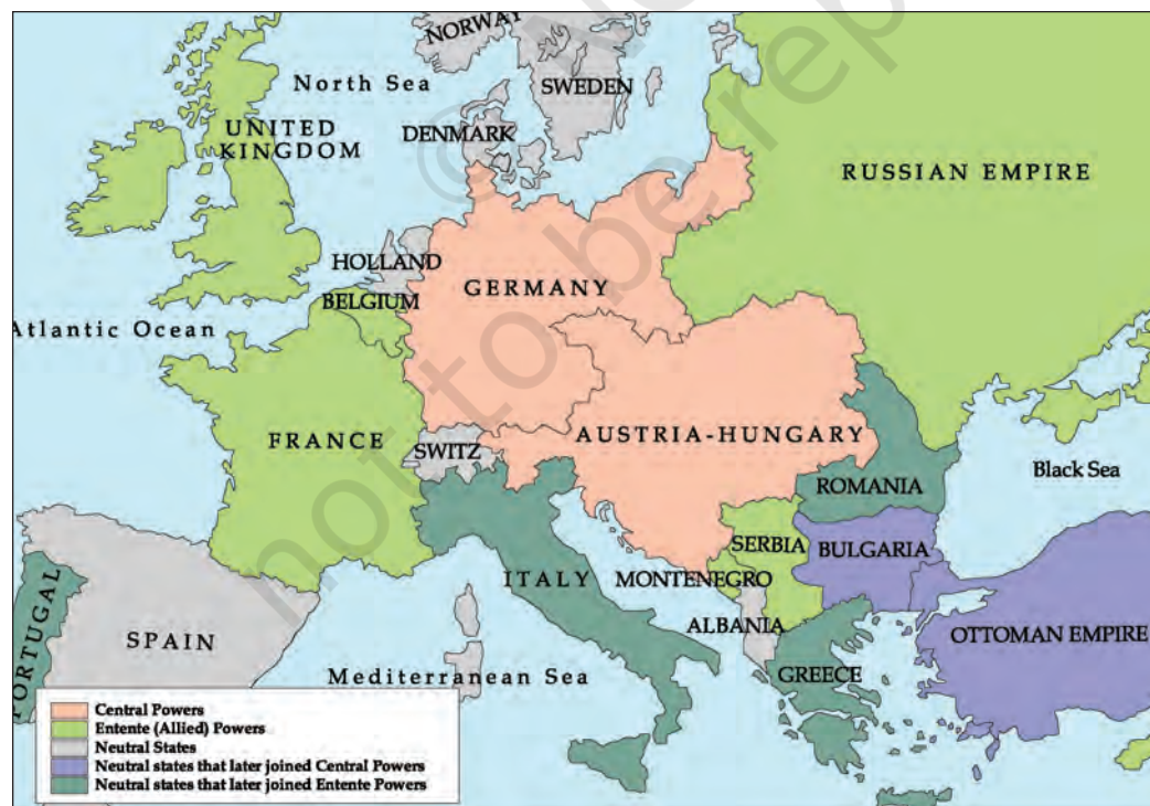
Fig.4 – Europe in 1914. The map shows the Russian empire and the European countries at war during the First World War.