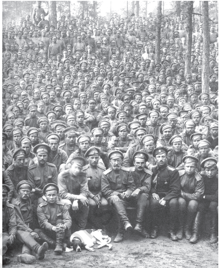
Fig. 7 – Russian soldiers during the First World War.

The war also had a severe impact on industry. Russia's own industries were few in number and the country was cut off from other suppliers of industrial goods by German control of the Baltic Sea. Industrial equipment disintegrated more rapidly in Russia than elsewhere in Europe. By 1916, railway lines began to break down. Able-bodied men were called up to the war. As a result, there were labour shortages and small workshops producing essentials were shut down. Large supplies of grain were sent to feed the army. For the people in the cities, bread and flour became scarce. By the winter of 1916, riots at bread shops were common.