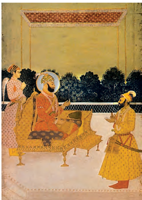
Fig. 2 Farrukh Siyar receiving a noble in court.

possible humiliation came when two Mughal emperors, Farrukh Siyar (1713-1719) and Alamgir II (1754-1759) were assassinated, and two others Ahmad Shah (1748-1754) and Shah Alam II (1759-1816) were blinded by their nobles.