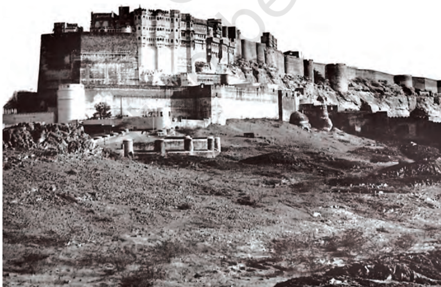
Fig. 5 Mehrangarh Fort, Jodhpur

Raja Jai Singh was at the height of his power. He was the governor of Agra for 12 years and of Malwa for 5 or 6 years. He possessed a large army, artillery and great wealth. His sway extended from Delhi to the banks of the Narmada.