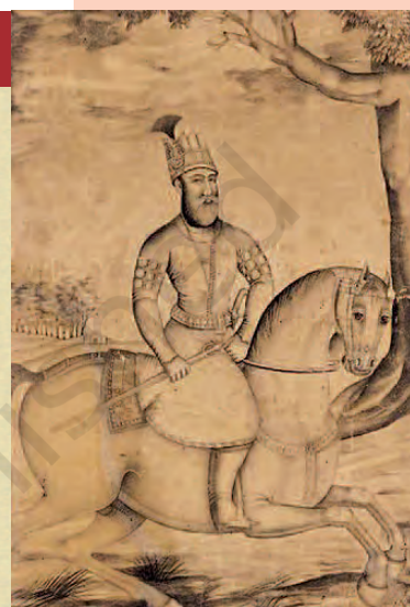
Fig. 1 A 1779 portrait of Nadir Shah.