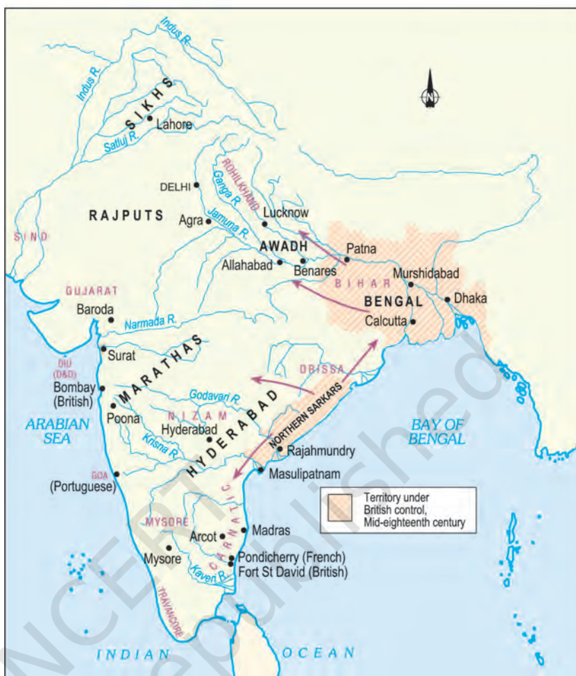
Map 2 British territories in the mid-eighteenth century.

In this chapter we will read about the emergence of new political groups in the subcontinent during the first half of the eighteenth century – roughly from 1707, when Aurangzeb died, till the third battle of Panipat in 1761.