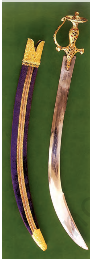
Fig. 7 Sword of Maharaja Ranjit Singh.

The organisation of the Sikhs into a political community during the seventeenth century (see Chapter 8) helped in regional state-building in the Punjab. Several battles were fought by Guru Gobind Singh against the Rajput and Mughal rulers, both before and after the institution of the Khalsa in 1699. After his death in 1708, the Khalsa rose in revolt against the Mughal authority under Banda Bahadur's leadership, declared their sovereign rule by striking coins in the name of Guru Nanak and Guru Gobind Singh, and established their own administration between the Sutlej and the Jamuna. Banda Bahadur was captured in 1715 and executed in 1716.