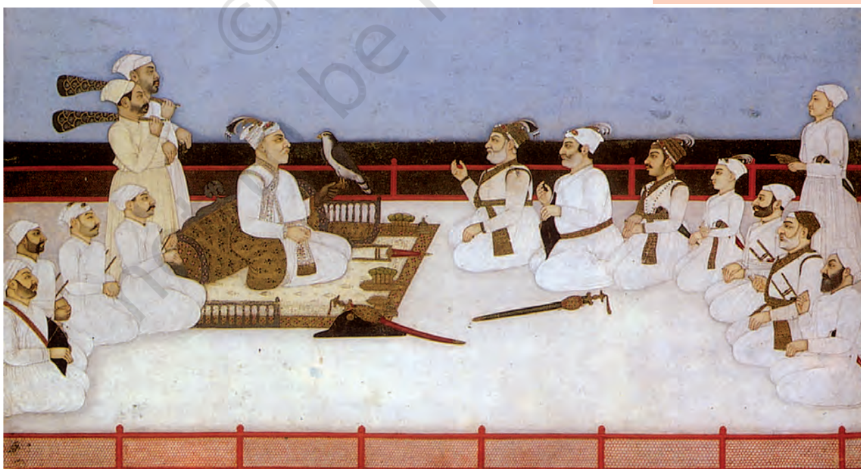
Fig. 4 Alivardi Khan holding court.

The formation of a regional state in eighteenth-century Bengal therefore led to considerable change amongst the zamindars. The close connection between the state and bankers – noticeable in