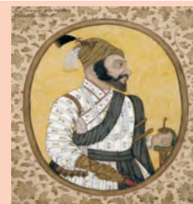
Fig. 7a Portrait of Shivaji

The Maratha kingdom was another powerful regional kingdom to arise out of a sustained opposition to Mughal rule. Shivaji (1627-1680) carved out a stable kingdom with the support of powerful warrior families ( deshmukhs ). Groups of highly mobile, peasant-pastoralists ( kunbis ) provided the backbone of the Maratha army. Shivaji used these forces to challenge the Mughals in the peninsula. After Shivaji’s death, effective power in the Maratha state was wielded by a family of Chitpavan Brahmanas who served Shivaji’s successors as Peshwa (or principal minister). Poona became the capital of the Maratha kingdom.