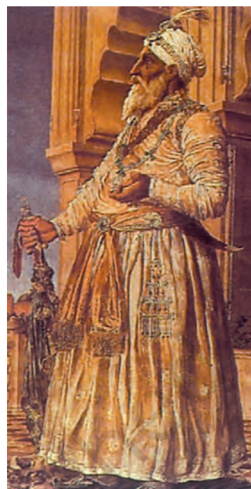
Fig. 3 Burhan-ul-Mulk Sa'adat Khan.

Burhan-ul-Mulk Sa'adat Khan was appointed subadar of Awadh in 1722 and founded a state which was one of the most important to emerge out of the break-up of the Mughal Empire. Awadh was a prosperous region, controlling the rich alluvial Ganga plain and the main trade route between north India and Bengal. Burhan-ul-Mulk also held the combined offices of subadari , diwani and faujdari . In other words, he was responsible for managing the political, financial and military affairs of the province of Awadh.