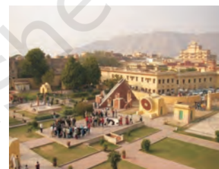
Fig. 4c Jantar Mantar in Jaipur

Sawai Jai Singh, the ruler of Amber constructed five astronomical observatories, one each in Delhi, Jaipur, Ujjain, Mathura and Varanasi. Commonly known as Jantar Mantar, these observatories had various instruments to study heavenly bodies.