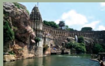
Fig. 4b. Chittorgarh Fort, Rajasthan

Many Rajput chieftains built a number of forts on hill tops which became centres of power. With extensive fortifications, these majestic structures housed urban centres, palaces, temples, trading centres, water harvesting structures and other buildings. The Chittorgarh fort contained many water bodies varying from talabs (ponds) to kundis (wells), baolis (stepwells), etc.