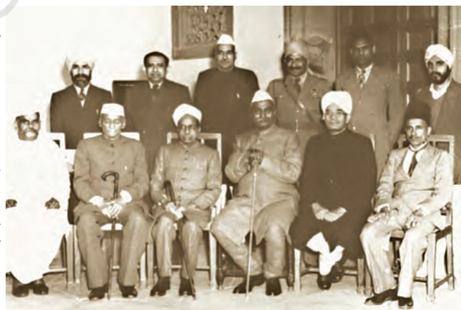
Some of the members who wrote the Constitution of India.

Therefore, India became a secular country where people of different religions and faiths have