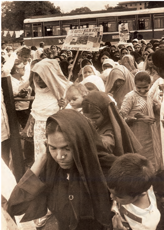
Women at a rally demanding their rights

discrimination had been practised in our society and how people had struggled against this. Many leaders of these struggles such as Dr Ambedkar had also fought for the rights of the Dalits.